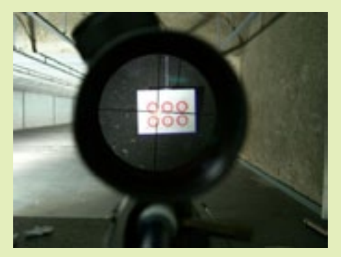
MR243 - Tikka