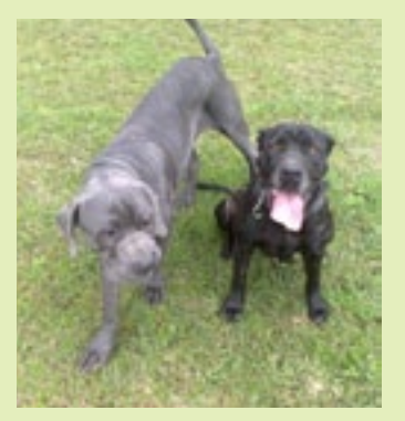
jamie k - Zoe and Titan