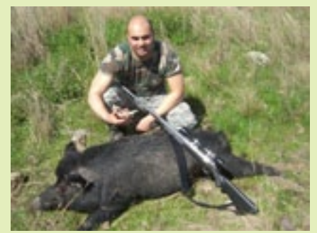
MR243 - Narrabri