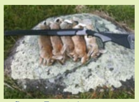
gafloss - Escorted