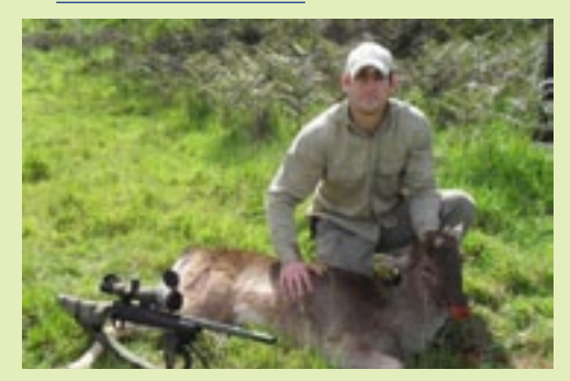
goswasere' - Fallow Spiker