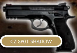
CZ SP01 SHADOW