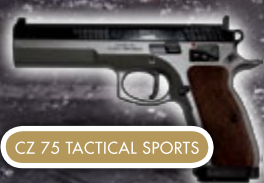
CZ 75 TACTICAL SPORTS