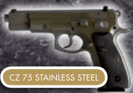
CZ 75 STAINLESS STEEL