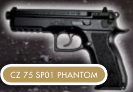
CZ 75 SP01 PHANTOM