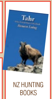
NZ HUNTING BOOKS