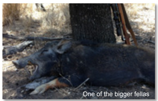
One of the bigger fellas

I focused on the half of property where the cattle are currently grazing. There's 3 dams this half so I hit the first and straight away pigs laying in the shade 2 shots 2 pigs. As I came to the next dam my quad spooked a wallowing pig out of his bath and he disappeared into the thick, but not to worry he'd have to be back. Hitting the next dam the cattle were drinking and resting around the shady dam. Being careful where my shots would go I walked around to find 3 pigs bedded in some