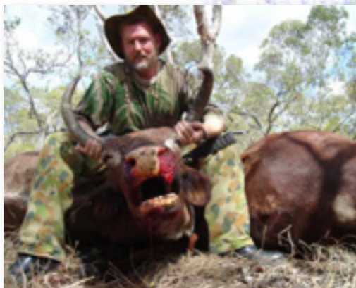
Author and “Old Wonky Horns”

We hit the property after three and a half days on “the frog and toad” and a 2700km haul.