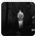
What FLIR sees