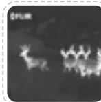
What FLIR sees

FLIR Systems Pty Ltd. 10 Business Park Drive, Notting Hill, Victoria 3168, Australia Tel AU: 1300 729 987 NZ: 0800 785 492 Email: info@flir.com.au www.flir.com