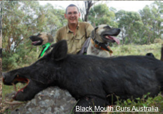
Black Mouth Curs Australia