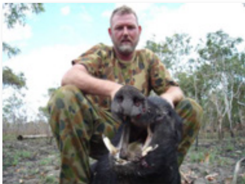
Author and another trophy grunter

One river crossing saw Des “DALBY”s” long in the tooth Hilux resemble an Aussie Collins class submarine, without the mechanical dramas.