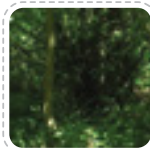
What you see