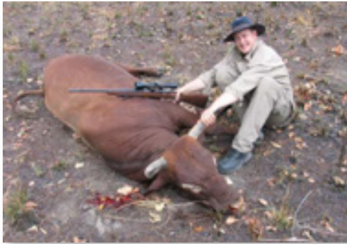
More steak for the BBQ

Closer inspection of his hide revealed numerous old battle scars. I was as proud as punch.