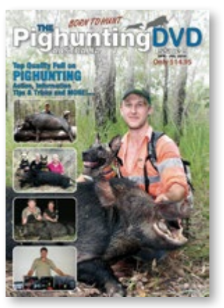
Watch the trailer

The Pighunting DVD includes top quality hunts from Cairns, Cape York, Darwin and the central tablelands.