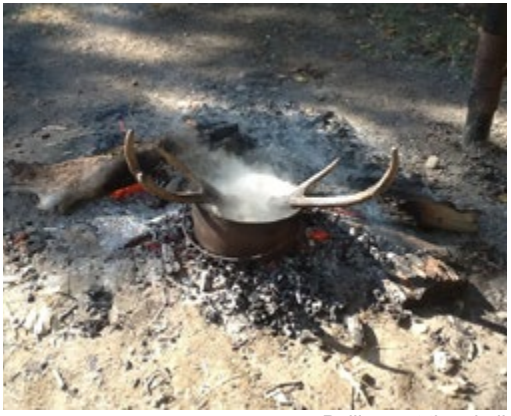
Boiling out the skull

of a good hit he pointed across the gully into a good clearing to our stag, he was down.