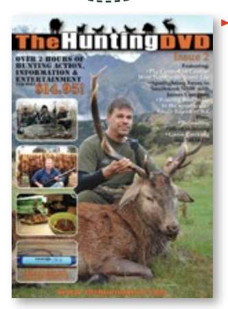
Watch the trailer

For more info visit: www.thebiglap.tv/aushunt