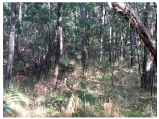
Where the deer were heading into bed

We made our way back up the gully to where Zach was sitting with the video and when we told him that we were confident