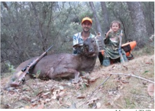
Me and TYB

Me and the boy walked all the way back to the ute, unloaded and packed up, then drove up to pick up our meat before heading home well after dark!!