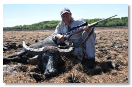
Author and Buff

After a quick photo session with them we began the task of cutting them up and taking them to the boat. We always give most of the meat to the locals which in turn they allow us to hunt their "country" here. These buffalo were by no means big but they made for some great tucker and filled the freezer for a while.