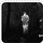
What FLIR sees