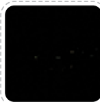
What you see