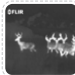
What FLIR sees

FLIR Systems Pty Ltd. 10 Business Park Drive, Notting Hill, Victoria 3168, Australia Tel AU: 1300 729 987 NZ: 0800 785 492 Email: info@flir.com.au www.flir.com