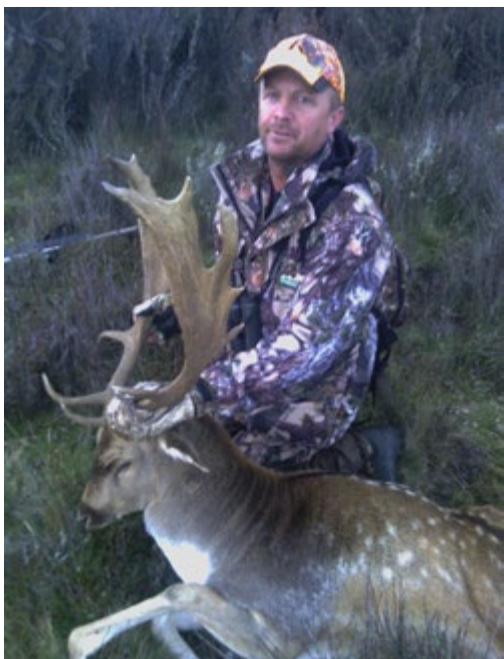
Author and his fallow stag