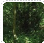
What you see