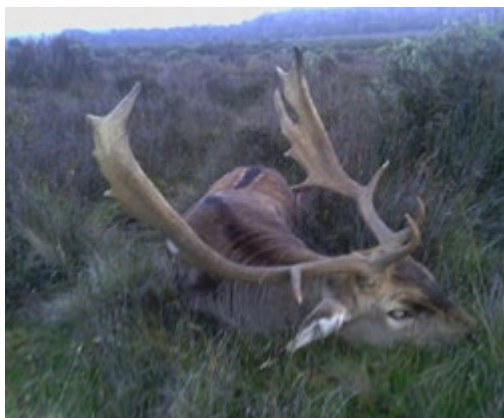
Central Highlands fallow hits the deck